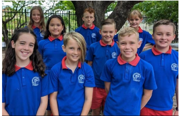
2023 Sports House Captains