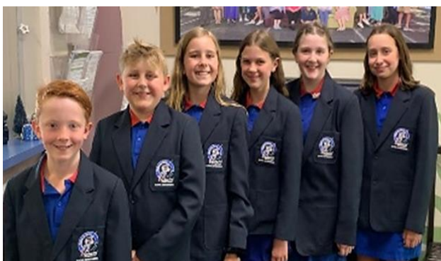
2023 School Captains & Vice Captains

Statements of Account will be emailed out in week 5 week – please note that no invoice will be issued. Thank you.