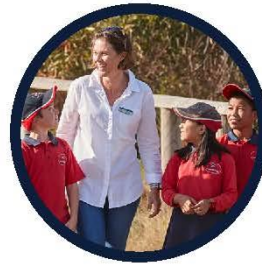
Build skills through fun